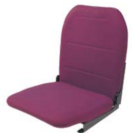
C Type 23A Upholstered insert seat & backrest