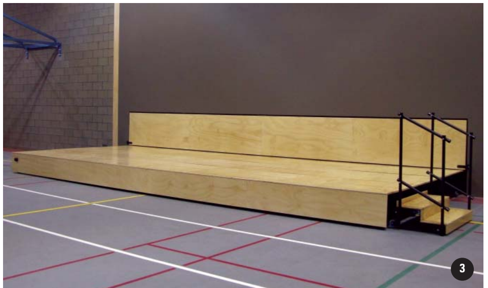
1, 2 and 3 Automated folding stage - fixed within wall Height 350mm Timber finish, clear urethane